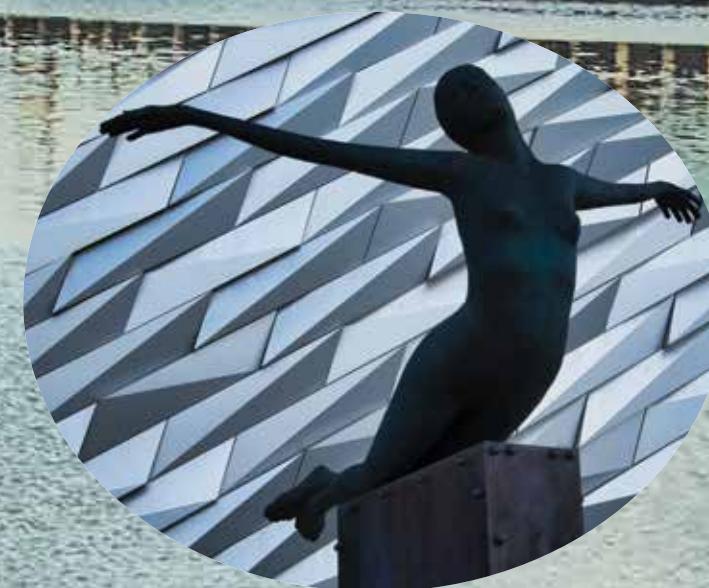
Titanica: Rowan Gillespie's bronze sculpture symbolizing hope and positivity.

The museum also places the Titanic in the broader context of Belfast's maritime history and industrial heritage. It explores the city's role as a major shipbuilding center and the impact of the Titanic's construction on the local community.